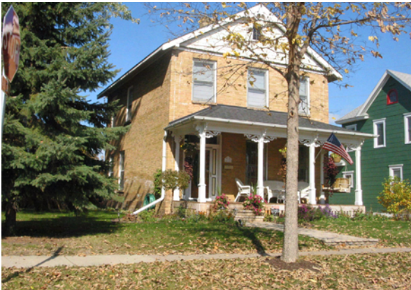
Historic Chaska brick houses dot the downtown neighborhoods.