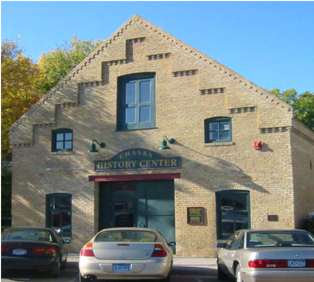
The Chaska History Center in the restored livery stable on Fourth Street West created a unique community gathering place in downtown.

Other important downtown gathering places include civic, faith-based, education and cultural institutions, such as the City Hall, library, County Gov’t. Center, schools, churches, and movie theater.