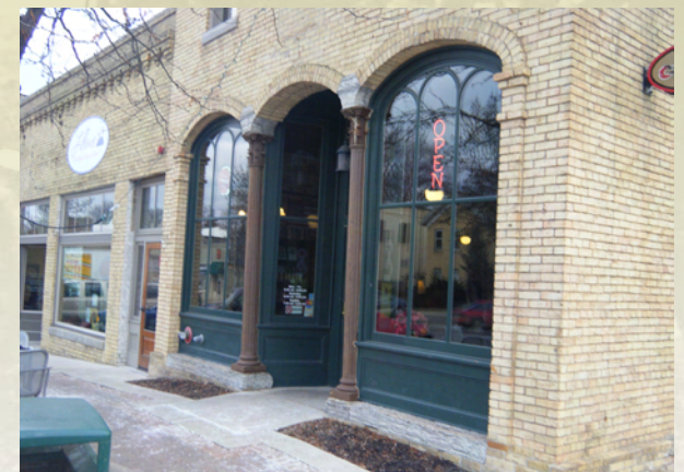
Restoration of the Philip Henk historic building on Second Street East added a full window storefront at street level with offices above.