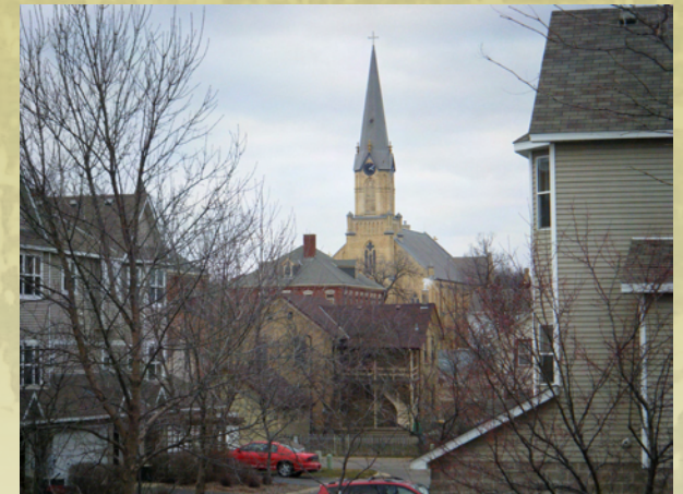
View of a historic downtown Chaska landmark, Guardian Angels Church with newer townhouses in the foreground.

In order to truly function as “Main Street” in the future, Chestnut St should be redesigned and reconstructed to better accommodate walkers, bicyclists and drivers visiting downtown businesses. Working with Mn DOT, the redesigned “Main Street” should provide parking on both sides of the street, wider sidewalks/pedestrian zones, and improved street crossing facilities for pedestrians and bicyclists.