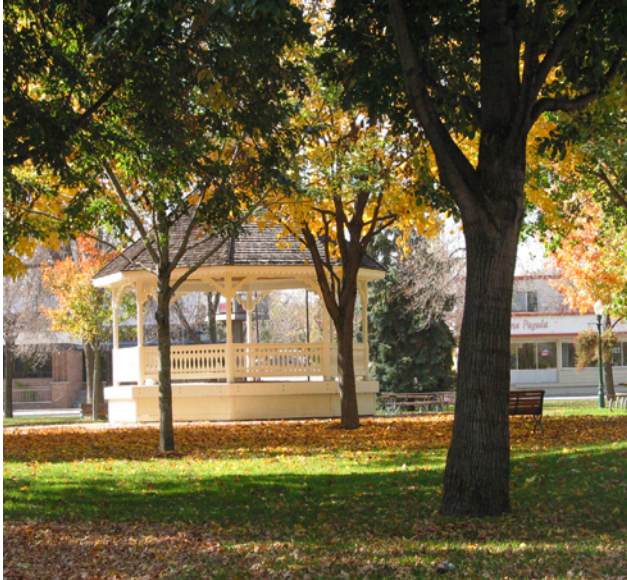
Historic City Square should remain the heart of downtown and the community as downtown is revitalized.