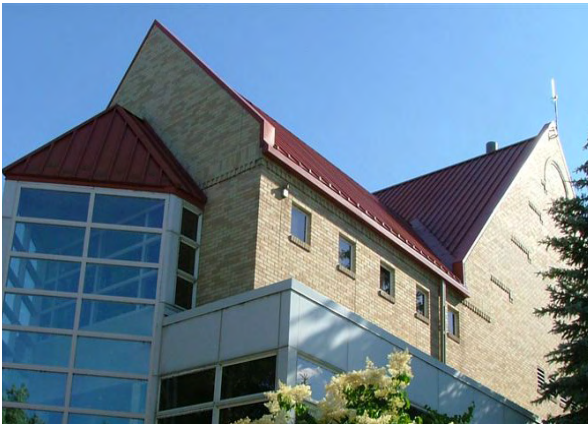
Chaska City Hall on Fourth Street West, which was completed in 1989, complements the character of downtown's historic buildings.