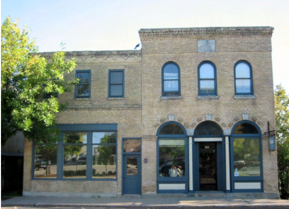
Chaska Herald historic building on Second Street West is one of the oldest continuing businesses in downtown Chaska.