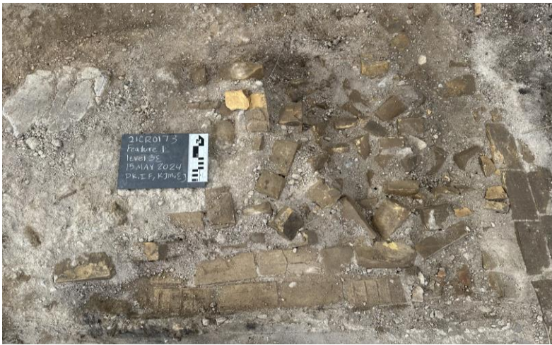
Brick foundations found in the northeast corner of the site (likely damaged when the building was demolished in 1970)

Excavation of the site took multiple weeks in May 2024. Archaeologists worked together with the construction crew to remove the paved surface of the parking lot, one half at a time. Once the pavement was removed, they took away the dirt about two inches at a time, carefully examining the ground for any artifacts or features that might be exposed. After every level, the archaeologists would record the position of everything they found (even brick fragments like the ones shown below) by taking photos, drawing maps, marking points on the GPS, and taking extensive notes. All this information is extremely important during archaeological excavations because once things have been dug up, they can never be put back exactly the same way again. That means we would lose all the information we might get from the artifacts about what happened at this site unless we make sure to record everything first. Once recorded, every artifact was collected and brought back to the lab for careful examination. At Site 21CR0173, the archaeologists only excavated as deep as the construction crew needed to complete their work, about 10 inches, but they still found hundreds of artifacts!