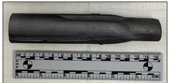
Artifacts found in 2022 at Site 21CR0173 linked to its use as a garage, (top) a portion of a graphite core from an early car battery, and as a livery, (bottom) a metal curry comb used for grooming horses

There is still more to find! Because this investigation was designed to mitigate the impacts of current construction, the lower portions of the site, particularly those related to the livery, were left undisturbed. These deposits are now preserved for future archaeologists!