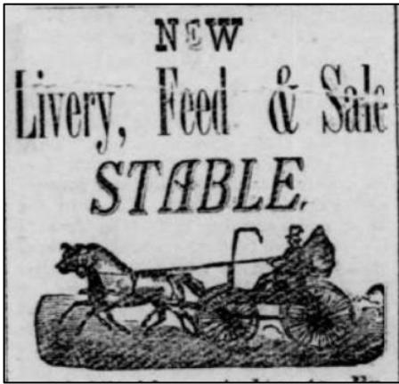
1885 newspaper ad for the Finnegan Bros. new livery stable business ( Weekly Valley Herald , 8 January 1885)