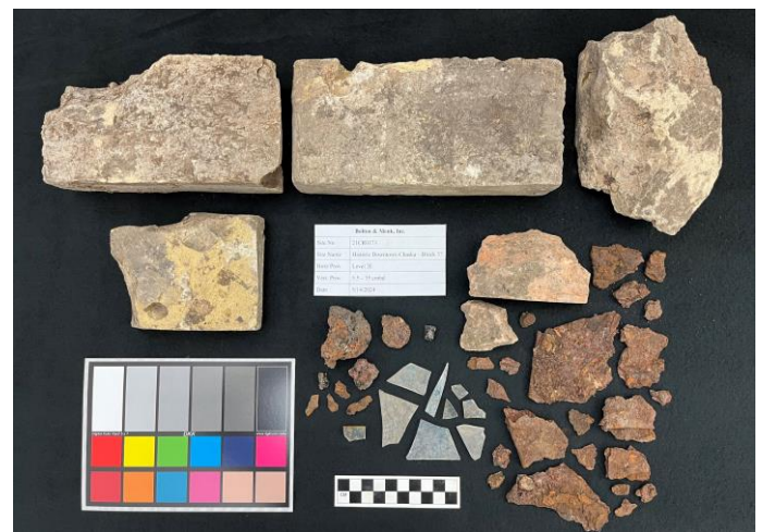
Artifacts found in 2024 related to the demolition of the building included rusted pieces of metal, glass, and Chaska brick