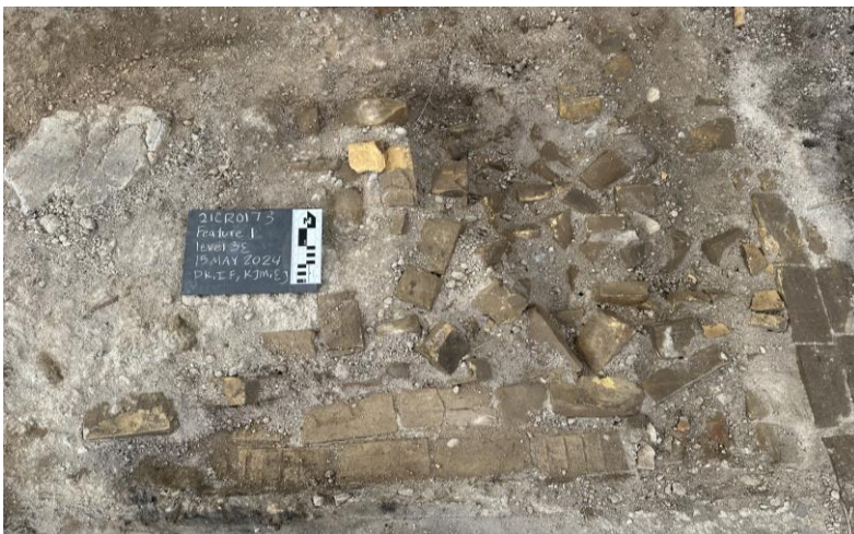
Brick foundations found in the northeast corner of the site (likely damaged when the building was demolished in 1970)

Excavation of the site took multiple weeks in May 2024. Archaeologists worked together with the construction crew to remove the paved surface of the parking lot, one half at a time. Once the pavement was removed, they took away the dirt about two inches at a time, carefully examining the ground for any artifacts or features that might be exposed. After every level, the archaeologists would record the position of everything they found (even brick fragments like the ones shown below) by taking photos, drawing maps, marking points on the GPS, and taking extensive notes. All this information is extremely important during archaeological excavations because once things have been dug up, they can never be put back exactly the same way again. That means we would lose all the information we might get from the artifacts about what happened at this site unless we make sure to record everything first. Once recorded, every artifact was collected and brought back to the lab for careful examination. At Site 21CR0173, the archaeologists only excavated as deep as the construction crew needed to complete their work, about 10 inches, but they still found hundreds of artifacts!