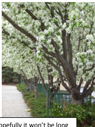
Hopefully it won't be long before City Plaza looks like this again.

The City of Chaska is always pleased to have new restaurants in the community and we encourage residents to try them out!