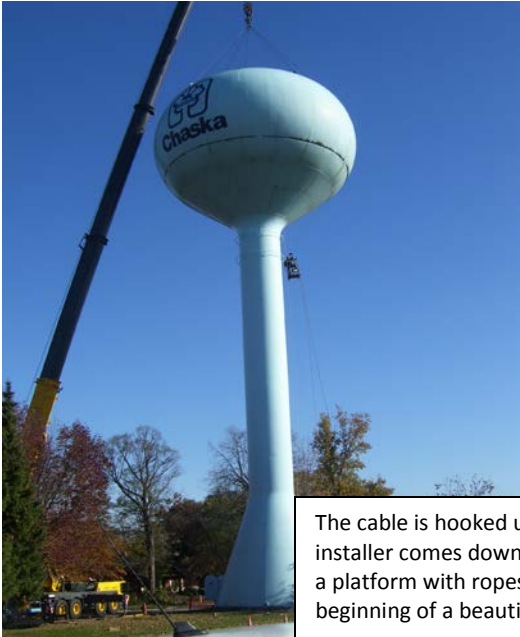
The cable is hooked up and the installer comes down the side on a platform with ropes at the beginning of a beautiful day.