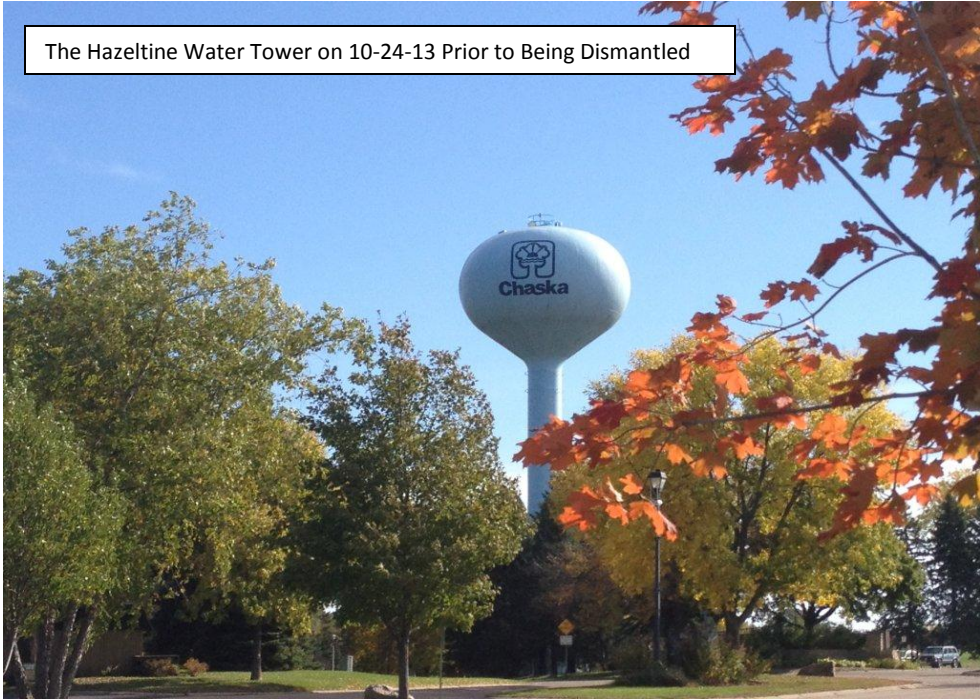
The Hazeltine Water Tower on 10-24-13 Prior to Being Dismantled