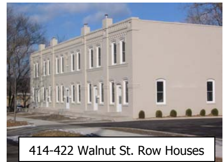
414-422 Walnut St. Row Houses

Minnesota Historical and Cultural Heritage Grants are made possible by the Minnesota Legislature from the Arts and Cultural Heritage Fund created with passage of the Clean Water, Land and Legacy Amendment to the Minnesota Constitution in November 2008. The grants are awarded to support projects of enduring value for the cause of history and historic preservation across the state.