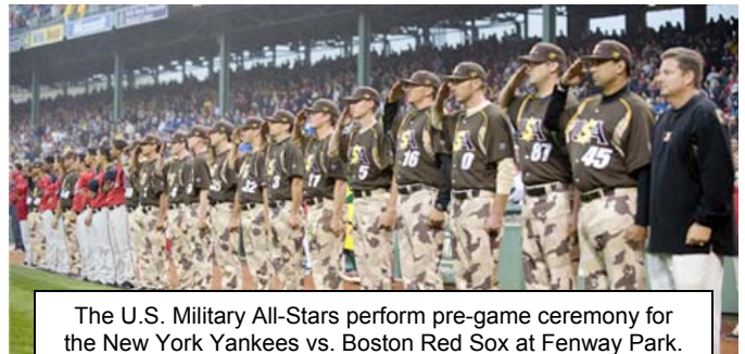
The U.S. Military All-Stars perform pre-game ceremony for the New York Yankees vs. Boston Red Sox at Fenway Park.